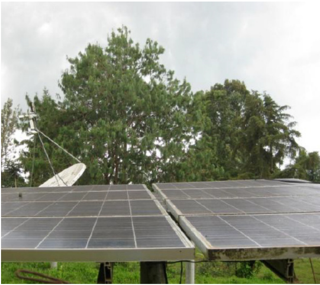
© Katrin Lammers. The solar system in Gimbo.